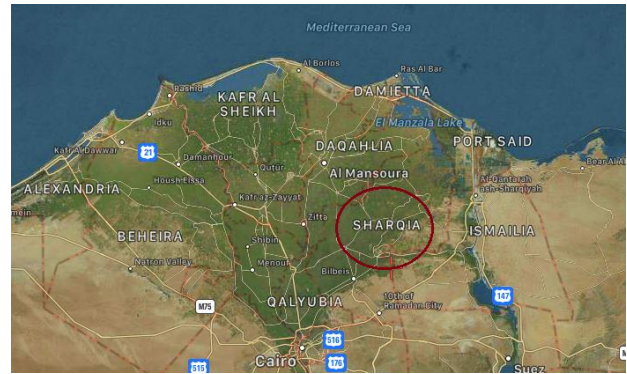
Figure (1): Sharqia Government (the study area) Samples collection

Figure 1: shows the Sharqia Government map in which the samples were collected. Sharqia is one of the northern governorates in Egypt. There are many crop plants in this area; and vegetables are the most dominant products beside rice. The farmers (workers) affected by the radiation that are released from both soil and plants.